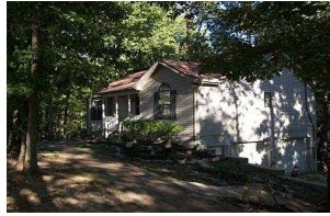
3 Bedroom, 3 Full Bathrooms, Located in Kingston Springs, TN MLS# 917166