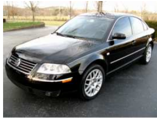
2003 Volkswagen Passat W8 4Motion. $21,299, Sedan, AWD, 48K miles