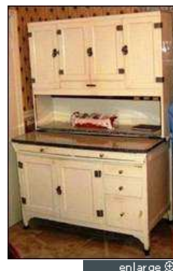
A Hoosier cabinet with flour bin/sifter, above and top middle, is worth $1,600, while the silver-plated sugar bowl with brackets for spoons, left and top left, would fetch $35.